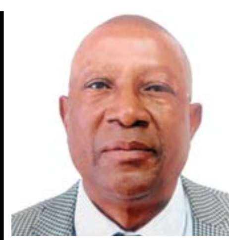
By Kristian Ngendina Auene

n its Manifesto, SWAPO Party oldsymbol{oldsymbol{\bot}} reaffirms its commitment to addressing pressing national challenges that inhibit socio-economic development in Namibia. By focusing on critical areas such as housing, healthcare, education, rural electrification, unemployment, access to finance, and youth entrepreneurship, the party aims to create an inclusive economy where all Namibians can thrive. This article outlines a comprehensive approach that emphasizes effective implementation, robust monitoring and evaluation, and a partnership between the public and private sectors to achieve these goals.