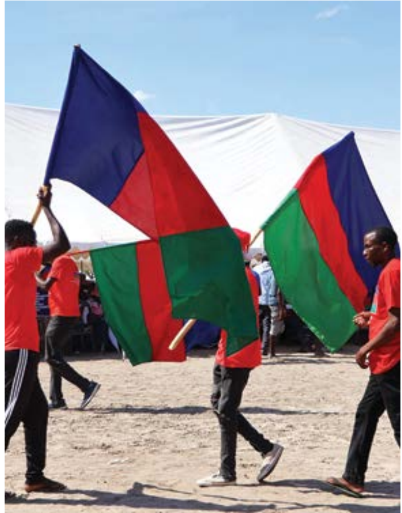
Young ones marching as they raise the SWAPO flag.