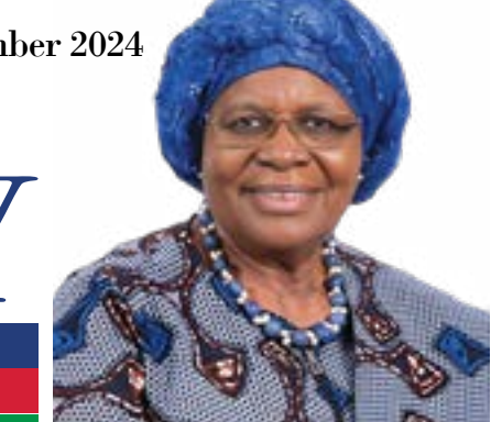
Solidarity • Freedom • Justice

Wednesday, 20 November - Tuesday, 26 November 2024