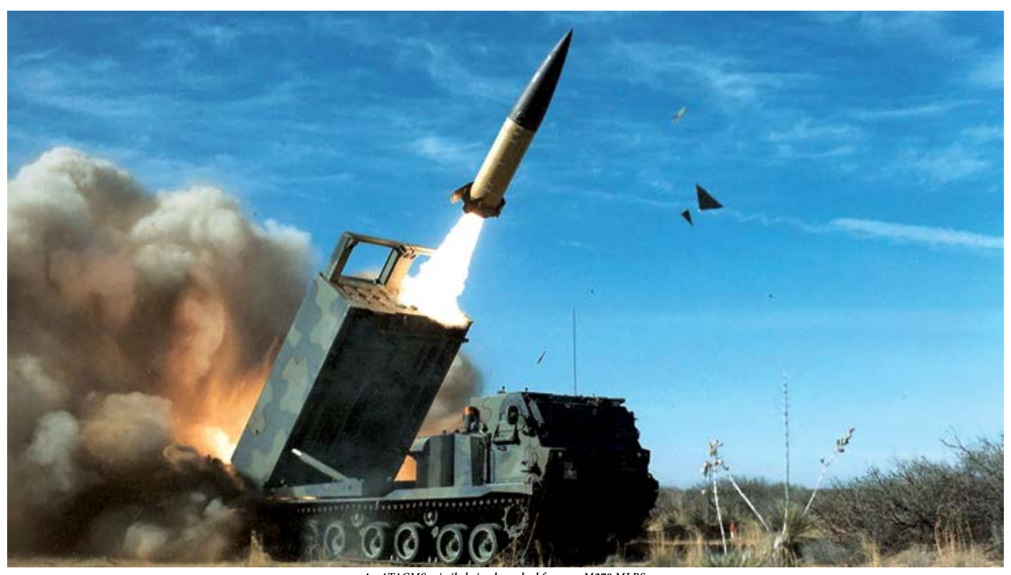
An ATACMS missile being launched from an M270 MLRS.