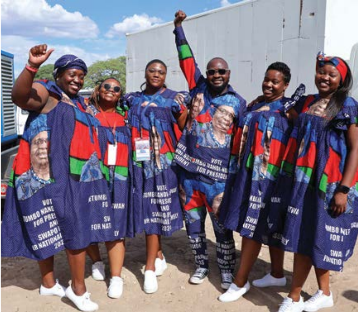
SWAPO\ Party\ members\ at\ Eenhana\ rally\ dressed\ in\ Netumbo\ attires.