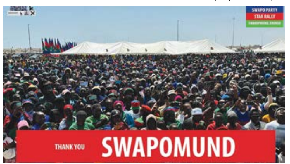
A fully packed SWAPO rally in Swakopmund last Sunday.

"Just look at this crowd! SWAPO has been and will always be the people's Party. You have come here in large numbers because SWAPO is the Party you trust. It is a Party with a sound track record in governance and the capability to steer Namibia towards a more prosperous future," said the President as the crowd erupted into songs and slogans.