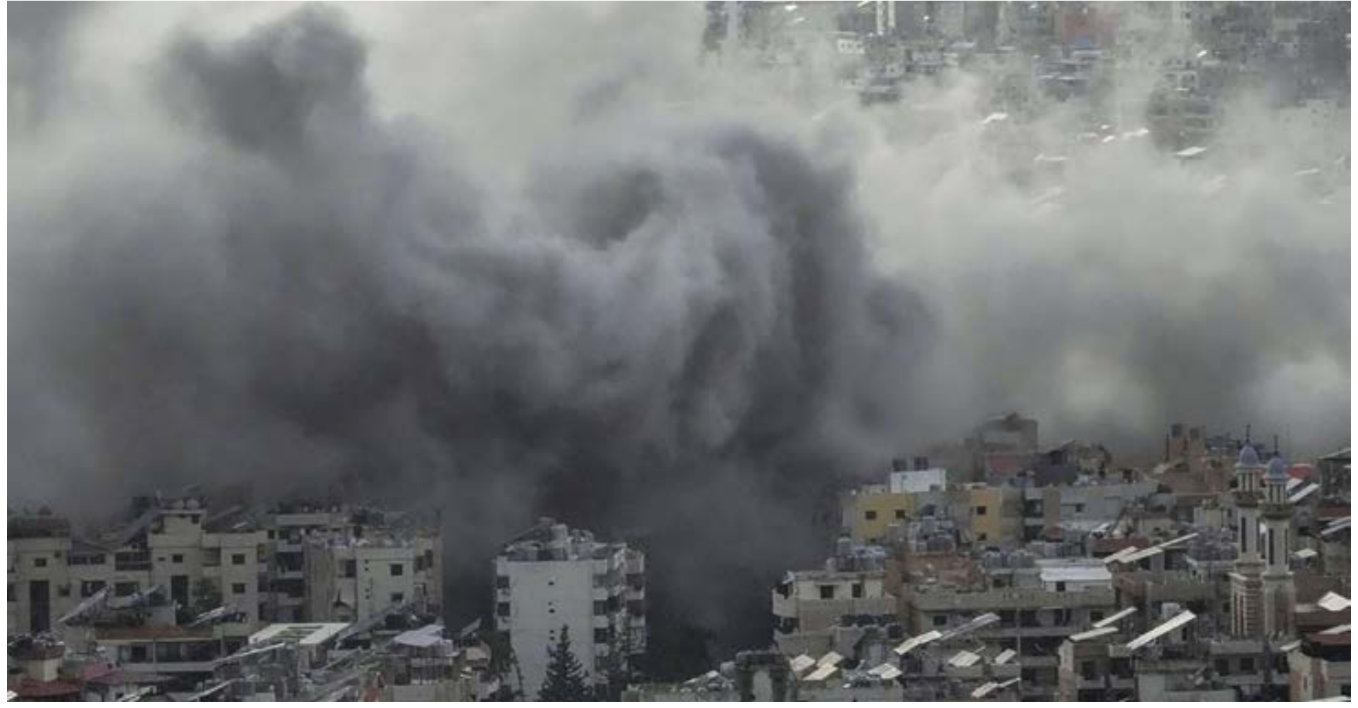
Smoke rise from Israeli airstrikes on civilian buildings in Dahiyeh, Beirut, Sunday, Nov. 24, 2024.