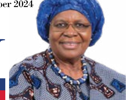
Solidarity • Freedom • Justice