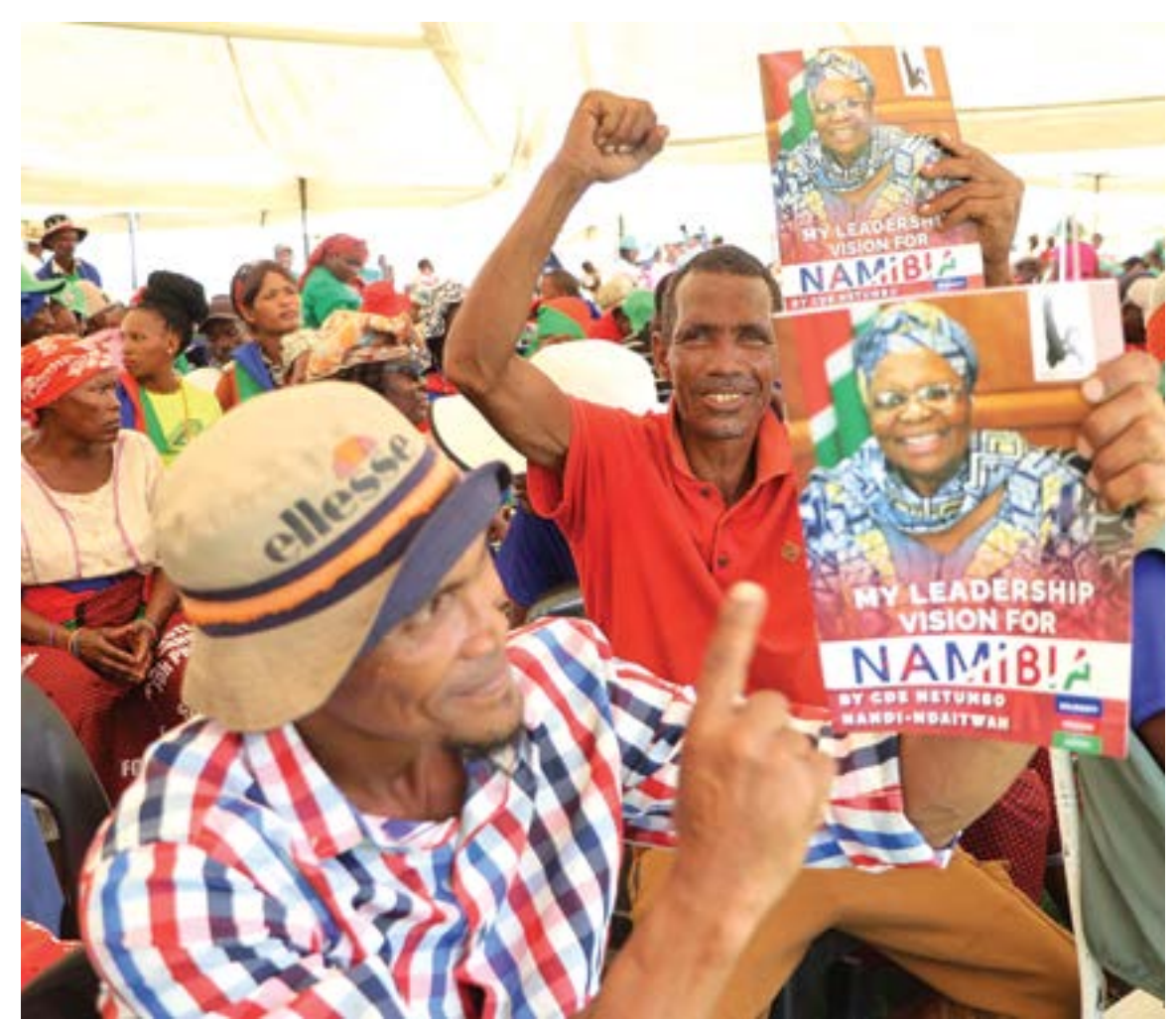
Scenes at Khomas Star Rally.